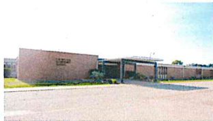
Millikin Elementary School 920 South Congress Geneseo, IL 61254 (309) 945-0475