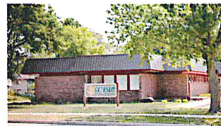
District Office 648 North Chicago Geneseo, IL 61254 (309) 945-0450