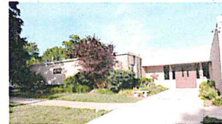
Northside Elementary School 415 North Russell Geneseo, IL 61254 (309) 945-0625