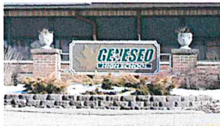
Geneseo High School 700 North State Street Geneseo, IL 61254 (309) 945-0399