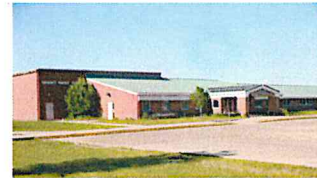
Geneseo Middle School 333 East Ogden Avenue Geneseo, IL 61254 (309) 945-0599