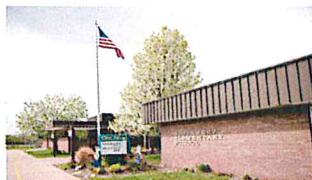
Southwest Elementary School 715 South Center Geneseo, IL 61254 (309) 945-0652